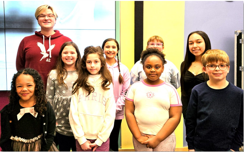
Art Beat 2026