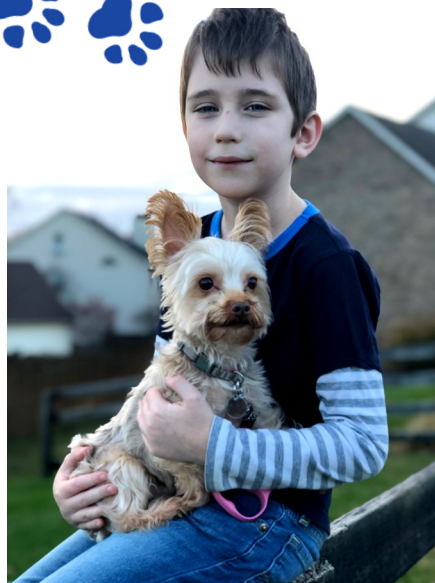
Murphy and Oliver, 8-year-old Yorkshire Terrier. He always challenges big dogs and thinks he's much bigger than the 4 lbs he is.