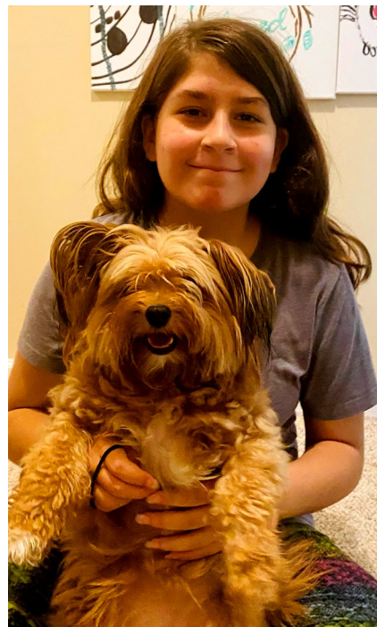
Scarlett with Sunny, 2-year-old Pomapoo (Pomeranian/Poodle). She likes salmon cat treats over all dog treats.