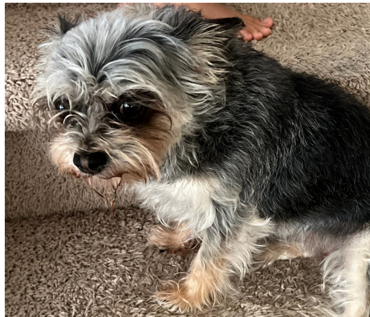
Emily's 6-year-old Yorkshire mix, Zooey