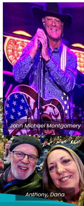
John Michael Montgomery