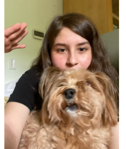
Scarlett with Sunny, 3-year-old Pomapoo (Pomeranian/Poodle). She likes salmon cat treats over all doa treats.